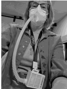
Figure 7-1 My Respirator

My respirator is a 4WDKING Rechargeable Electrical Air Purifying, Reusable Portable Air Purifier with HEPA filter for Sleeping, Outdoor Sports Housework, purchased on Amazon on November 18, 2024. Note: it does not prevent contaminants from entering through your eyes.